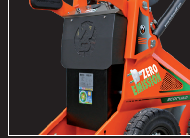
36V battery: better performance and less overheating