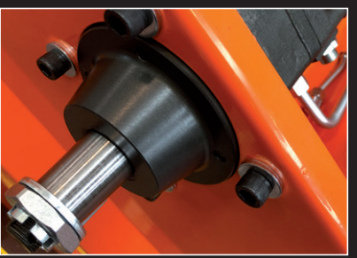
Power setting from 10% to 100% 4 hydraulic engines with hydrostatic High efficiency engine braking system