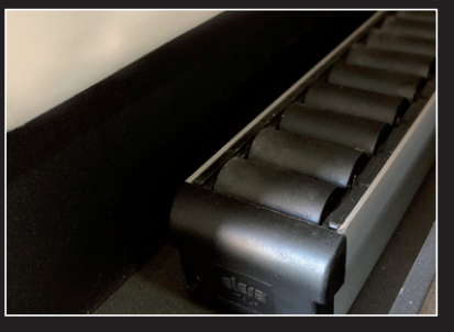
Battery replacable in 5 minutes thanks to QEX quick extraction rail